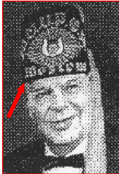
Written on this Fez is Moslem