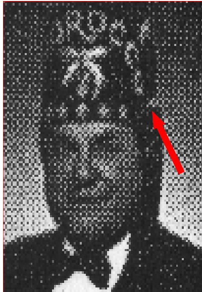
Written on this Fez is Morocco

The World knows EXACTLY Who You Are, and are waiting for you to awaken. In Secret YOUR existence is ritualized by those who sit in the seats of Power, who have adopted your information, and don YOUR Noble Titles, as indicated in these photos. Top Left: Islam; Top Right: Moslem; Bottom Left: El Bey; Bottom Right: Morocco.