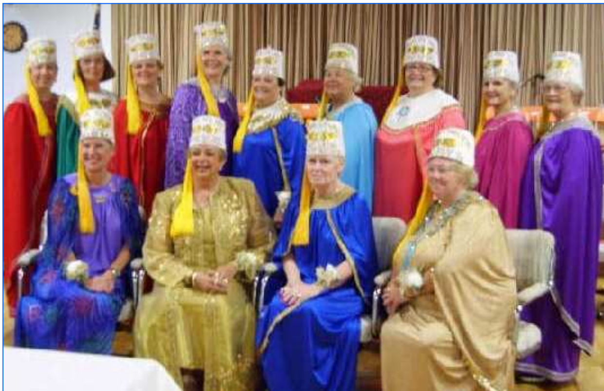
Members of The Daughters Of The American Revolution —The D.A.R.

If you do not plan (plant) to bring any more royal crowns here, please teach your daughters, who are the direct descendants of the founders of Civilization. Teach them Ancient High Science, Culture, Gnosticism, Cosmology, Alchemy, Geometry, Algebra, Numerology, Astrology, Architecture, Mathematics, Philosophies, and the science of the Womb, as everyone else is drawing wealth and knowledge from it and wearing it (the symbol of the womb) atop their head as their royal crown, except for the Mother of Civilization herself. —YOU! The Moabite / Moorish / Asiatic / African Woman.