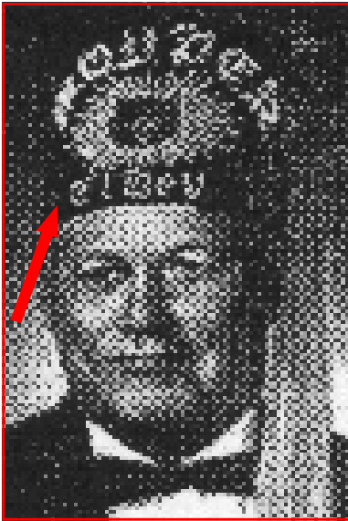
Written on this Fez is El Bey