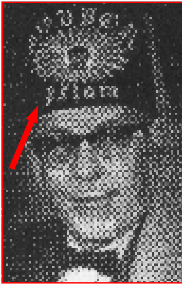
Written on this Fez is Islam